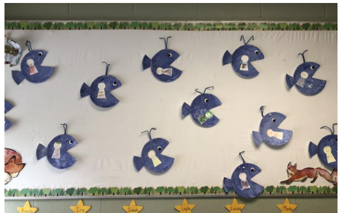
Students in the Pre-K & K classroom made Jonah IN the whale crafts. How cute!