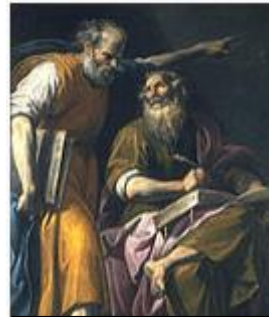
St. Mark writes his Evangelium at the dictation of St. Peter, by Pasquale Ottino, 17 th century, Beaux-Arts, Bordeaux

When Peter was arrested by Herod Agrippa I in the first year of Herod's reign over Judea, he was miraculously saved by angels and escaped. (Acts 12:1-19). He began his travels, visiting various churches, and arrived in Rome in the second year of Emperor Claudius, about AD 42.