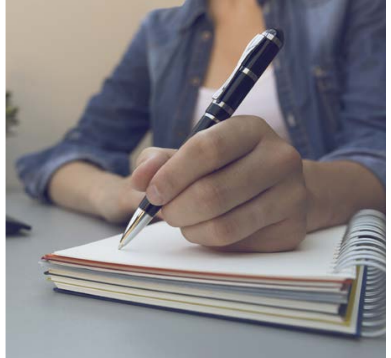
When you get an urge, write it down.