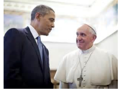
President Obama and Pope Francis

It didn't take but a year after his inauguration for much of the world to discover that Pope Francis was an advocate of the poor, foe of unrestrained free-market capitalism, reformer of the Roman Curia (administrative apparatus of the Holy See) and affable to world leaders and the masses. His image as a powerful geopolitical provocateur continues to be headline news! He believes: 1