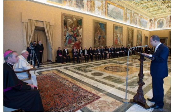
U.N. Board of Coordination meeting with Pope Francis

Ban Ki-moon made an amazing gesture on May 9, 2014. He flew 29 of his key U.N. agency heads (chief executives of the Board of Coordination) to meet with Pope Francis. It was during that meeting that this pope pled with those world leaders to redistribute the wealth of the rich to the poor. 12 This was another appeal to the greed of the world’s citizens. 13 This remains a part of the Catholic social doctrine agenda spawned in 1891.