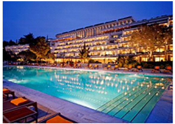
Astir Palace Hotel Resort Athens, Greece

For decades myriads of leaders from many international organizations have been meeting to discuss a world government with a central head. One example occurred with the Bilderbergers' annual convention, which met May 17, 2009, at the Astir Palace Hotel Resort in Athens, Greece (the group began in 1954). Those meetings were so secret that they had hundreds of police, navy commandos, Coast Guard speed boats and F-16 fighter planes to guard the area.[3] The latest: June 12, 2011, in St. Moritz, Switzerland.