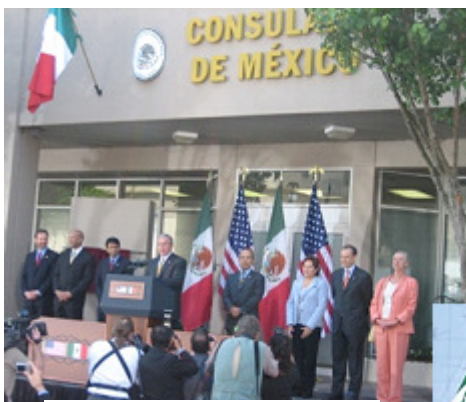
North American Leaders' Summit – Mexico - 2005