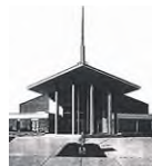
First Seventh-day Adventist Church of Tulsa