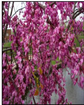
Buchanan, MI Redbud City