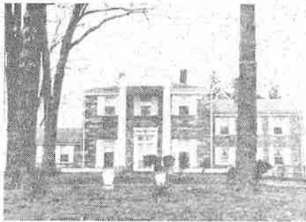
Glenmore, circa 1950