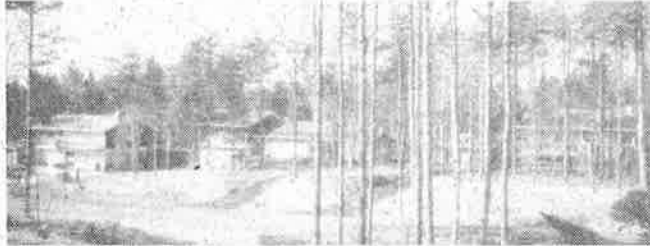
Carderock Springs circa 1963