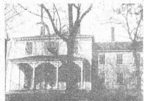
Glenmore, circa 1910